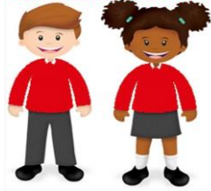
Our School Uniform

Just a reminder that we have second hand uniform available should any of our families need it. Please contact either office and we can arrange to deliver this to you discreetly.