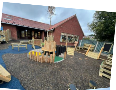
The Nest Outdoor Provision