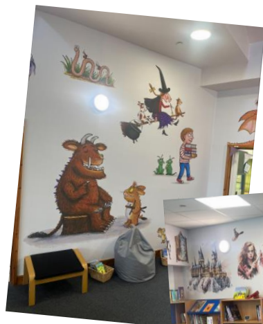
Our beautiful new library complete with new books and resources